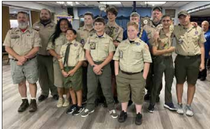
On June 14th our lodge celebrated flag day. Each participant received a pin commemorating our nations 250th independence. Boy Scout troop 344 helped with the celebration.

In Comradeship Johnny Miller (727) 642-8004