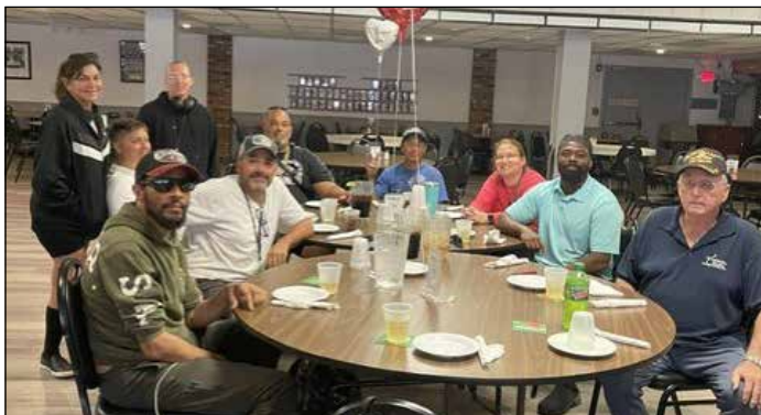
Fishing trip was canceled. Brought the veterans to our lodge for lunch and then off to Seminole Lanes for bowling. Next fishing trip is set for July 8th.