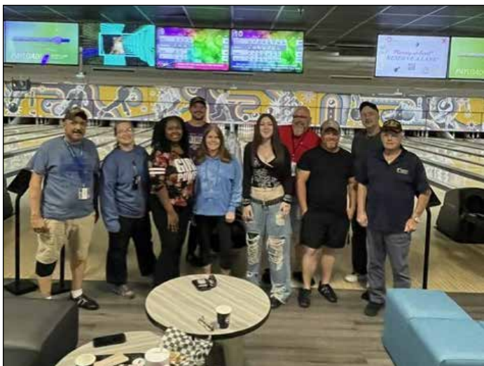
The first outing for the veterans. Bowling at Seminole Lanes one Wednesday month from during the day. 11:30AM-3PM Stay tuned for future dates.

As a reminder, the St. Petersburg Elks Lodge #1224 is a members-only organization.