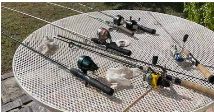
Over $300 worth of fishing tackle was donated by our Elks Lodge.